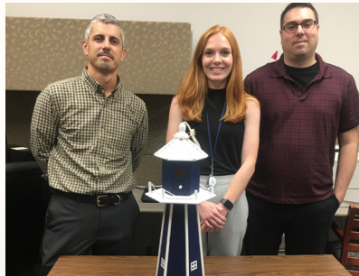
Staff created birdhouses and gifted them to residents at the Fairport Baptist Homes