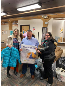
Dropping off items from our Winter Clothing Drive

One way we like to thank the communities we serve is through Family First staff and management participating in activities that support those communities. As a local financial institution, our employees live in the same neighborhoods our members do, and we are happy to help and demonstrate our commitment to East Rochester, Greece, Henrietta, Penfield, Webster, and the Greater Rochester area.