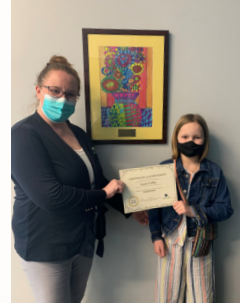
Proudly displaying student artwork in our Greece branch