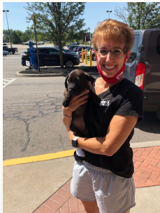
Our sponsored dog transport with Joyful Rescues