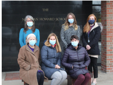
Donated to the Norman Howard School to fund their new EquatIO mathspace for virtual learning